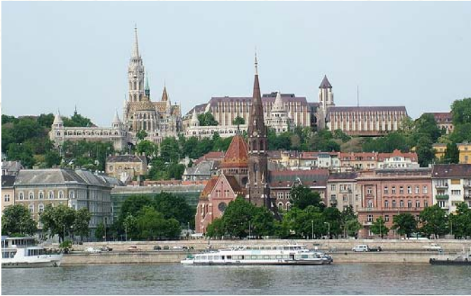
Fisherman's Bastion & Matthias Church

Today you start off your cruise tour in Eastern Europe's liveliest and most cosmopolitan metropolis. You will see the massive hilltop castle complex with Fisherman's Bastion and the Matthias Church, Shop for renowned peasant embroidery, Herend porcelain and paprika. Breakfast Included.