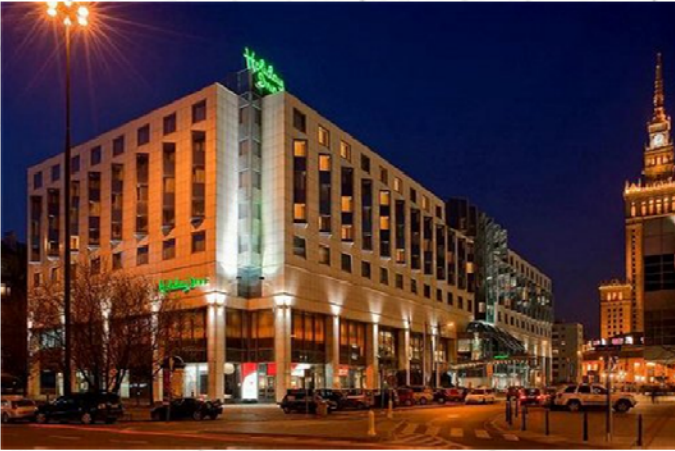
Holiday Inn, Warsaw

Arrive in Warsaw. You will be met by a host who will take you to your hotel, Holiday Inn in a private mini bus. The rest of the day is at leisure.