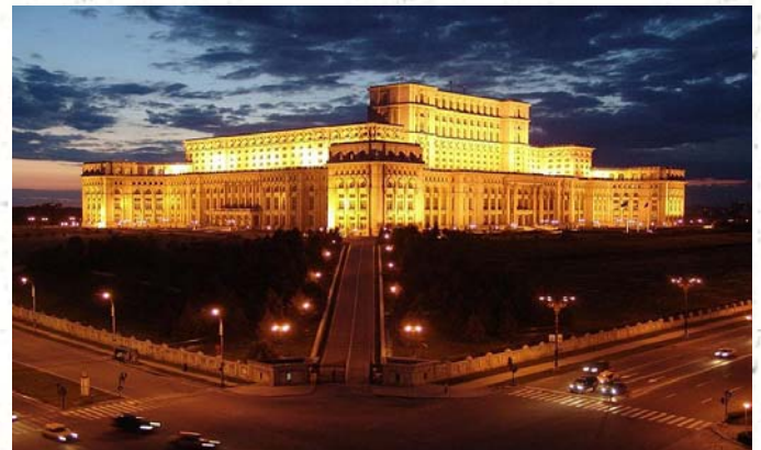
Parliament Building, Bucharest

Bucharest, Romania's lively capital and known as "Paris of the East" is only a short drive from Oltenita. Your afternoon tour will include the impressive Parliament Building, second in size only to The Pentagon. The former Royal Palace is now home to The National Art Museum. You will check into your hotel, Athenee Palace Hilton. Breakfast Included.