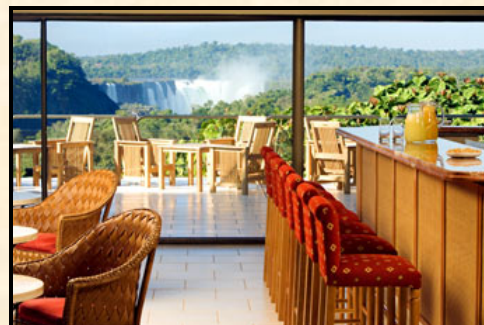
Sheraton, Iguazu Falls