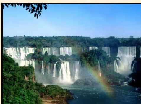
The Iguazu Falls