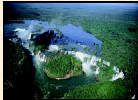
The Iguazu Falls

Today you will have a day of leisure in Buenos Aires. Check out time is at 6:00 PM. You will be transferred to the airport for your flight home.