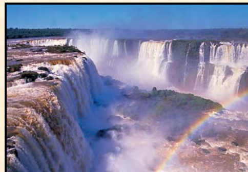
The Iguazu Falls