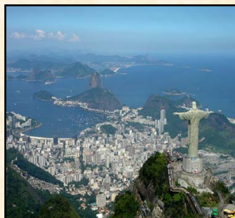
Christ the Redeemer